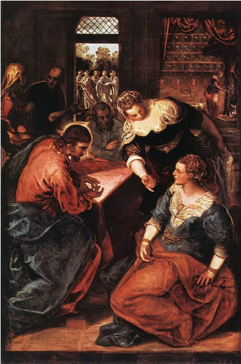
Figure 2: Tintoretto, J.R. Christ in the House of Martha and Mary